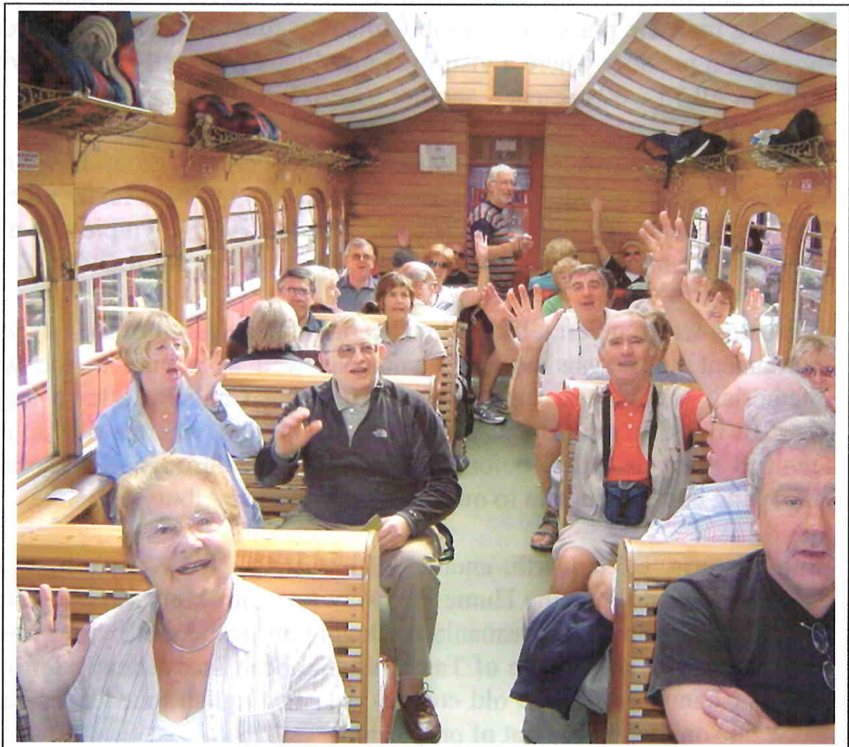
Aboard the West Coast Wilderness ABT Railway – Strahan to Queenstown.