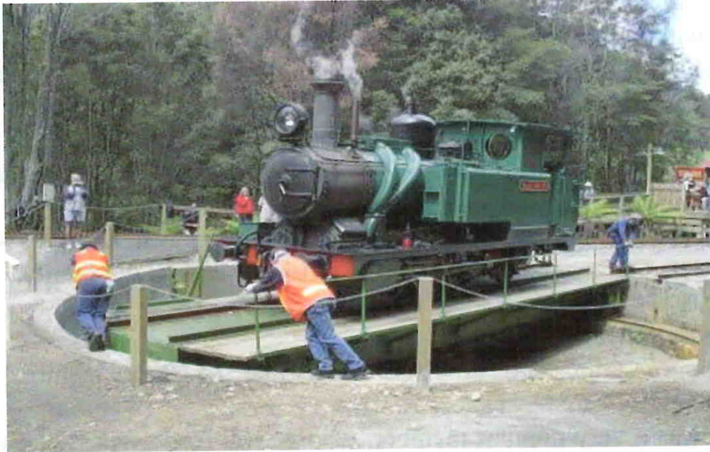
Showing How it's Done Turning the Train Around at Dubbil Barrill

The train trip from Strahan to Queenstown on the West Coast ABT